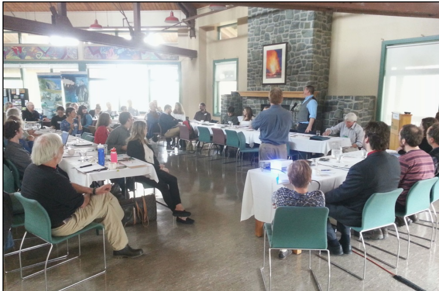
Newfoundland and Labrador Protected Areas Forum - May 13, 2015

Now, the question is: who will undertake these actions and how will we organise ourselves most effectively to do it? As a start, the volunteers and limited staff of CPAWS-NL and Nature NL have taken on the job of producing these proceedings of the forum and, more importantly, will work with all conservation groups to connect and pool resources so as to ensure that the action items are addressed. We will work toward having significant progress by the time of our second annual protected areas forum in 2016.