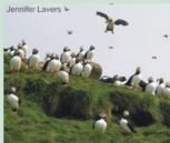
Atlantic Puffin breeding colony

Common Murre (Turr) with geo-locator, Thick-billed Murre (Turr). Tracking turrs in winter helps determine potential risk from oil spills.