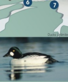
Ducks (Pie Duck)