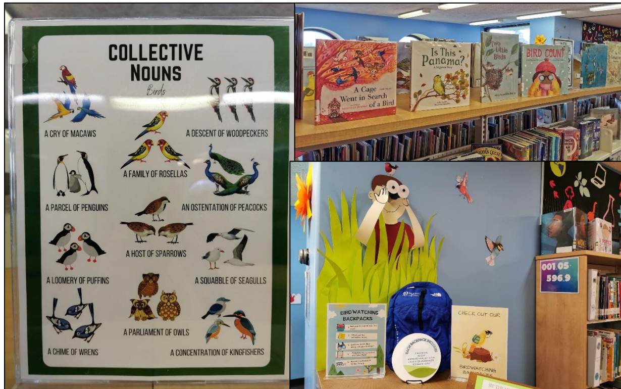
Figure 2 Birdwatching Backpack display at the AC Hunter Public Library in St John's.